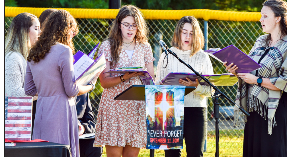
Union County High School chorus students sing "Amazing Grace" at the Sept. 11 remembrance in Meeks Park on Saturday.