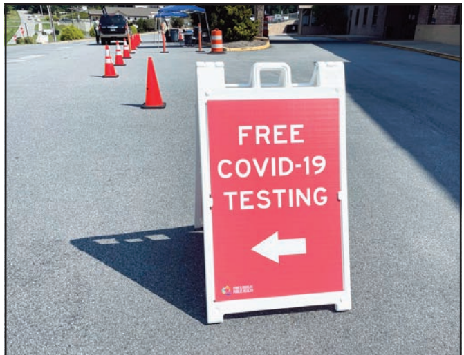
The Georgia Department of Public Health District 2 has contracted to provide free local drive-thru COVID-19 testing at Union General Hospital.

Fewer but sicker development, though there are 2.1% to 30.6% on Sept. 10. some signs of hope amid the